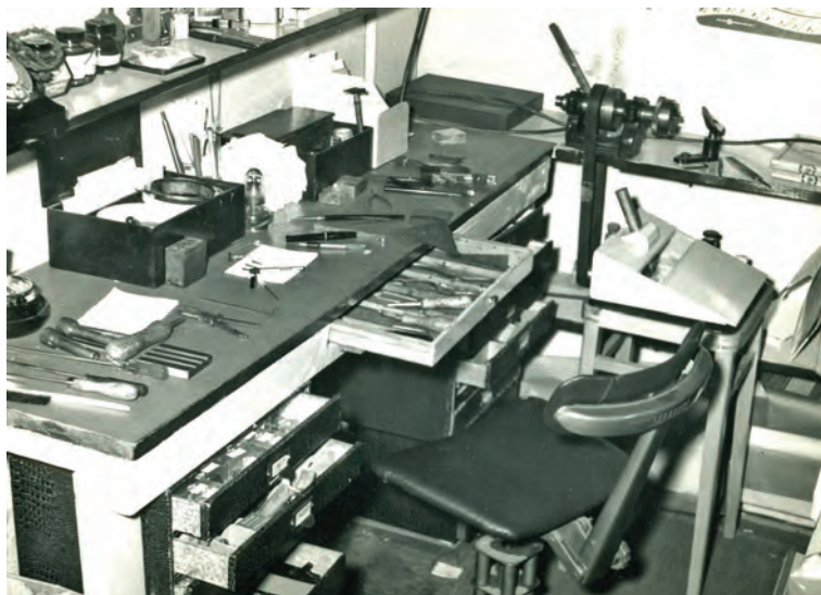
Pen repair bench at 70 High St Oxford -Pens 1970s